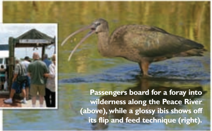
Passengers board for a foray into wilderness along the Peace River (above), while a glossy ibis shows off its flip and feed technique (right).

adversely affecting the quality, and Charlotte County has been unsuccessful in blocking the pollution.