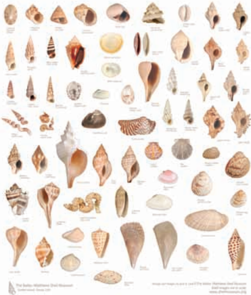
(Above) The colorful seashell poster being sold to help support the Bailey-Matthews Shell Museum. (Below) A future environmentalist works on a craft project during "Ding" Darling Days.