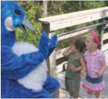
Two youngsters meet a friendly bird during "Ding" Darling Days.

projects, and we make stuffed manatees, wildlife masks, and more. Plus there are free hot dogs, refuge tram tours, and live wildlife presentations.”