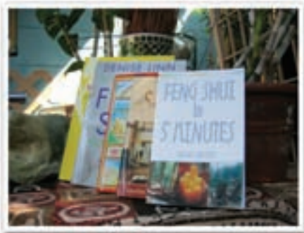
Feng Shui can be learned using books such as those found at Wind and Water (above), but for a quicker solution, call in an expert.