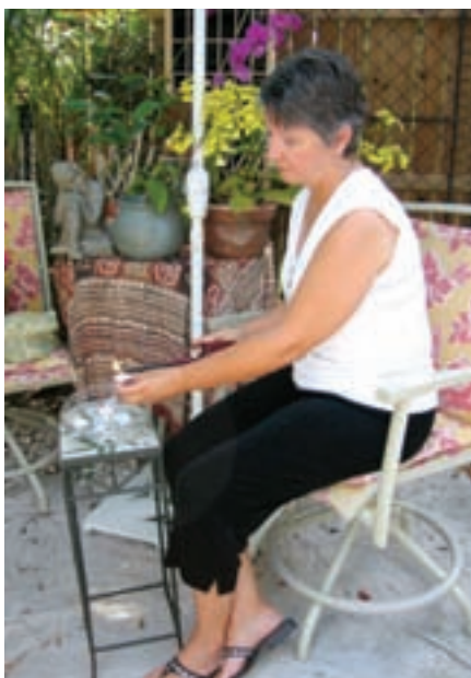
Candles are just one of a number of Feng Shui tools Luten brings to each consultation.