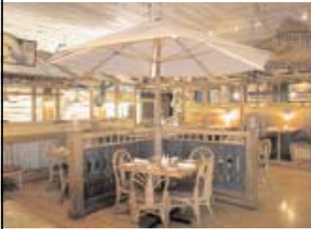
The Timbers Dining Room