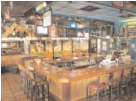
The Bar at the Sanibel Grill