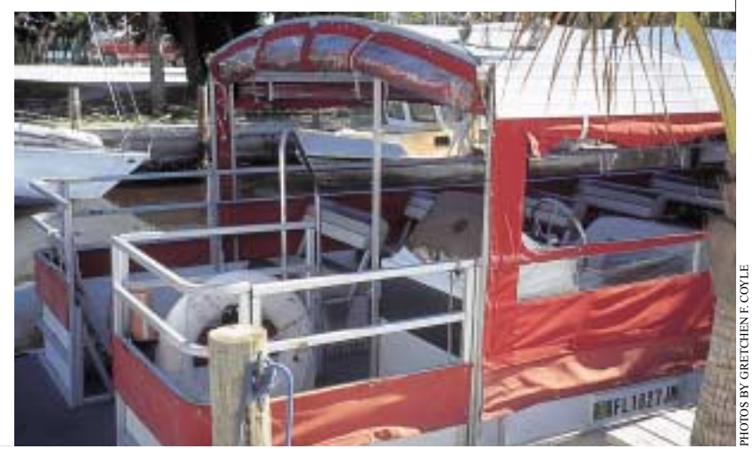
Need a ride to an island escape? Or maybe you want to explore the area's waters? Hop aboard Cheryl Mays's Island Charters (clockwise from left), Emily LoCicero's Island Girl Charters, or the Morton family's cruise boats at Jug Creek Marina.

o yellow cabs or airport limos are in sight, and instead of pavement there is clear blue water underneath, dolphins jumping alongside the boat, and a brilliant sky as licensed captains shuttle people from local marinas to outlying islands. These ferries and water taxis haul people back and forth no matter