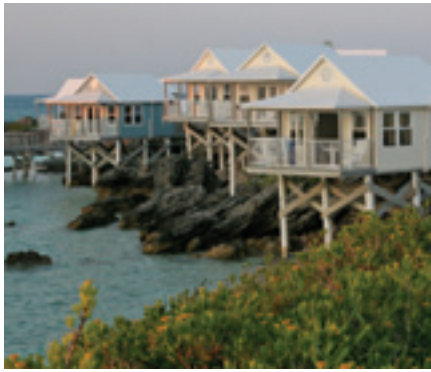
(above) 9 Beaches offers a “green” alternative with stilted cabanas wrapped in sail cloth. (below) Father and son enjoy a once-in-a-lifetime round at Port Royal Golf Course.

continues centuries-old traditions. High pitch stair-stepped roofs stand strong against the winds and filter precious rain water to home cisterns. Our stay at Midway cottage brought back memories of a home long gone. Surrounded by English gardens, we enjoyed fresh picked bananas and fell asleep to the sweet smell of flowers. And with a television and full-size kitchen, the guys watched ESPN and we saved a bundle at the grocery.