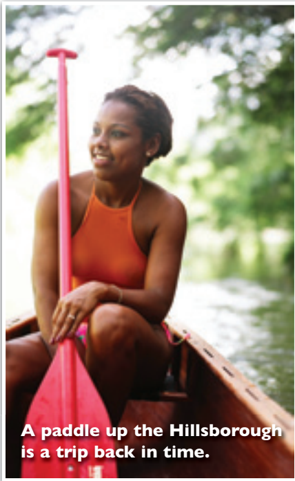
A paddle up the Hillsborough is a trip back in time.