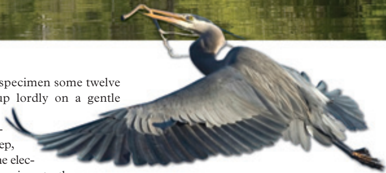
(Top) Its thick canopy insulates the Hillsborough River from extraneous noise and civilization.

Downriver twelve miles, car horns, exhaust fumes, and skyscrapers set the scene where the Hillsborough River plunges through downtown Tampa's metropolitan hub. The only ones paddling there are the University of Tampa sculling team.