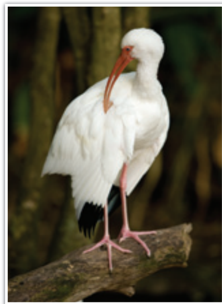
A white ibis preens on a log, indifferent to the presence of humans.