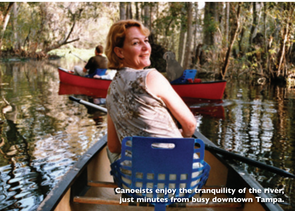
Canoeists enjoy the tranquility of the river, just minutes from busy downtown Tampa.