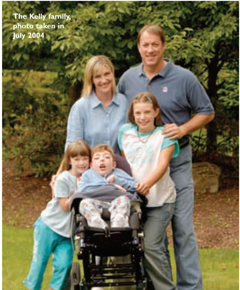
The Kelly family, photo taken in July 2004