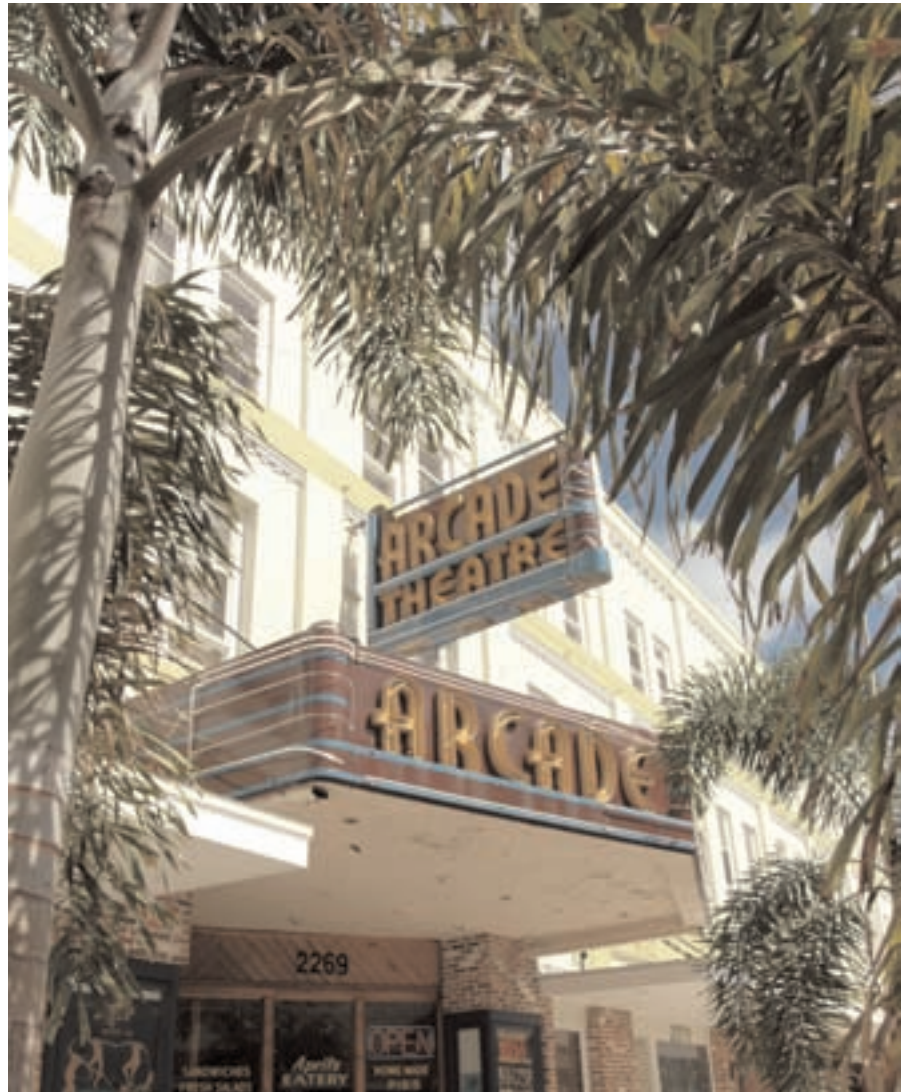
The Arcade Theatre is one of many venues at which Southwest Floridians can enjoy live theater.