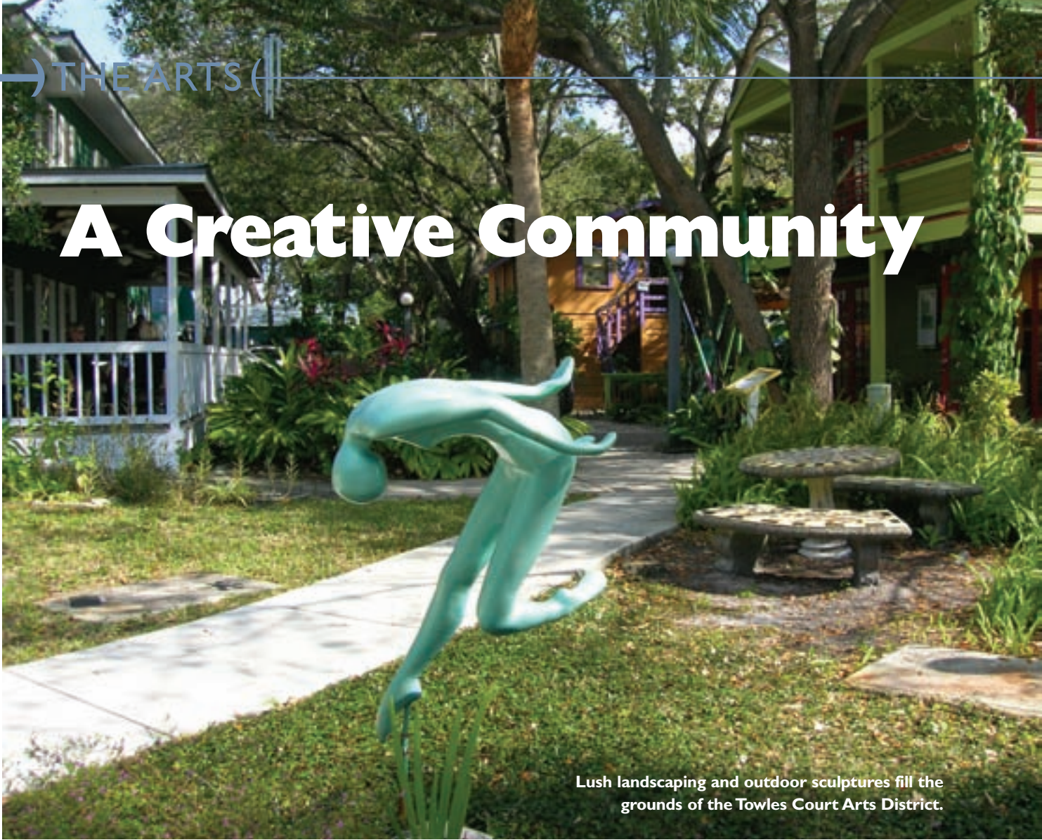
Lush landscaping and outdoor sculptures fill the grounds of the Towles Court Arts District.