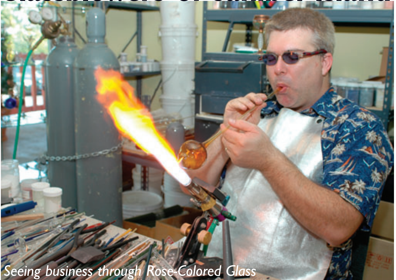
Seeing business through Rose-Colored Glass