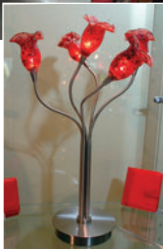
One of the results of Thiemann's artistry is this elegant lamp made of steel and rose-colored glass.

friends: "Their referrals are phenomenal."