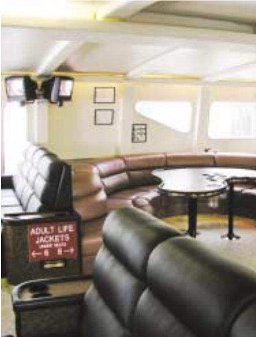
The VIP deck on Fast Cats Ferry Service features comfortable seating and a menu of premium drinks and meals.