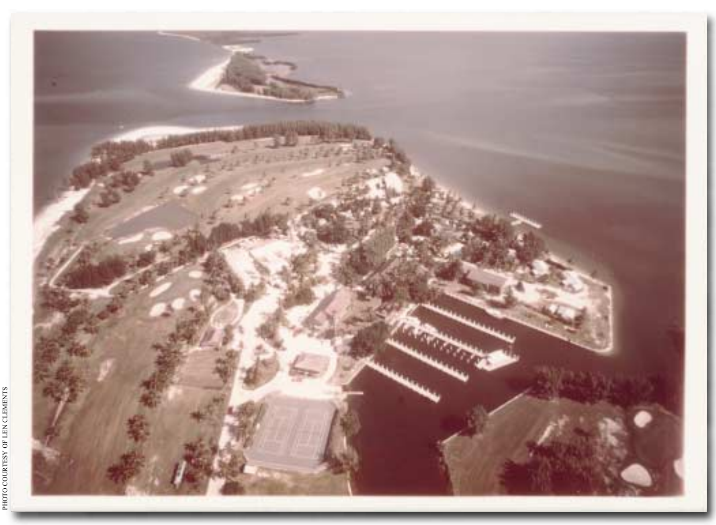
The Captiva property, pictured here around 1975, was zoned for 3,900 units until Mariner petitioned Lee County for a reduction to 912 units.

Ironically, the same issue of Sports Illustrated that celebrated the natural beauty of Captiva with a bikini-clad model also included an article called "There's Trouble in Paradise," detailing the dangers of Florida development. According to authors Robert Boyle and Rose Mary Mechem, only "38 percent of Florida estuarine habitat is still in a near pristine condition. Miles of mangrove stands have been ripped up