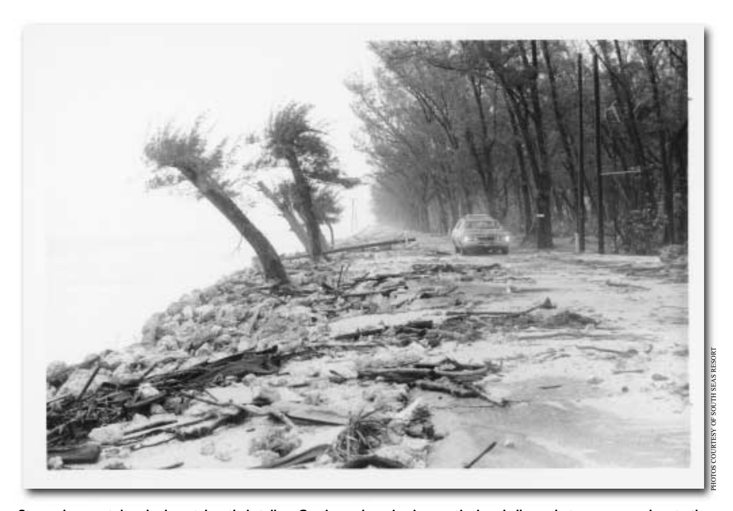
Storms in recent decades have taken their toll on Captiva and erosion is a continuing challenge, but none come close to the hurricane of 1921, which wiped out the crops and sent many homesteaders packing.

and smothered, and fish populations have dropped alarmingly."