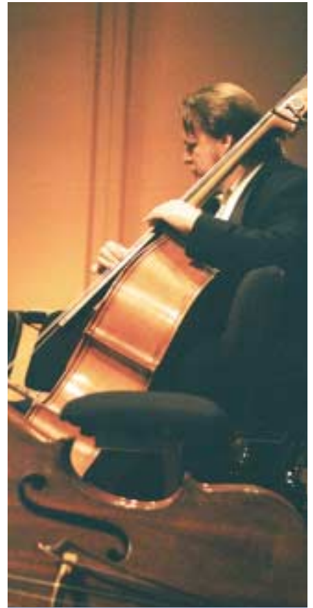
The Naples Philharmonic Orchestra will celebrate its 20th anniversary with an Opening Night Gala! Nov. 2.