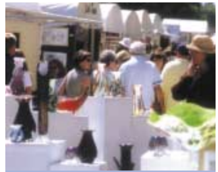
Artists and artisans will display their works Oct. 19 and 20 at the Downtown Naples Art Fair.

Golf and Country Club, Ft. Myers, 239/939-3213