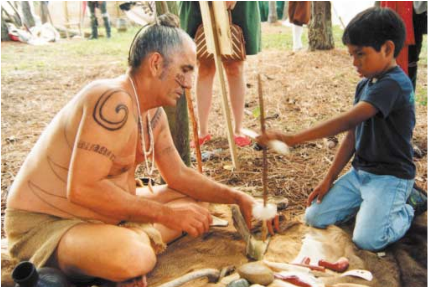
The annual Old Florida Festival celebrates thousands of years of Florida's history, with participants reenacting particular cultures and their traditions. The festival will take place Nov. 1-3 at the Collier County Museum in Naples.