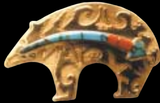
Pin, 14k gold, turquoise and coral heartline, 1.5" long, by D.M. Navajo (actual size)

Specializing in fine art from the tribal traditions of Africa, Australia, Native America and the Arctic.